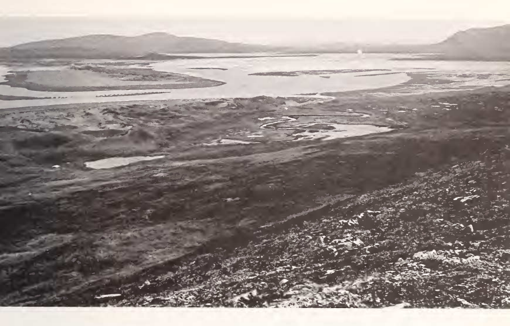
Fig. 7. Nanvak Bay at low tide and adjacent dunes and wetlands.

and vegetation composed of Elymus arenarius , Honckenya peploides , and Mertensia maritima , and dwarf shrub mat.